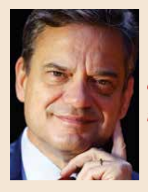
The cost of loss of independence is steep.

important institutions. To help assure that in any new order democracy is central, don't we need something similar for "systemically important debt contractions"?